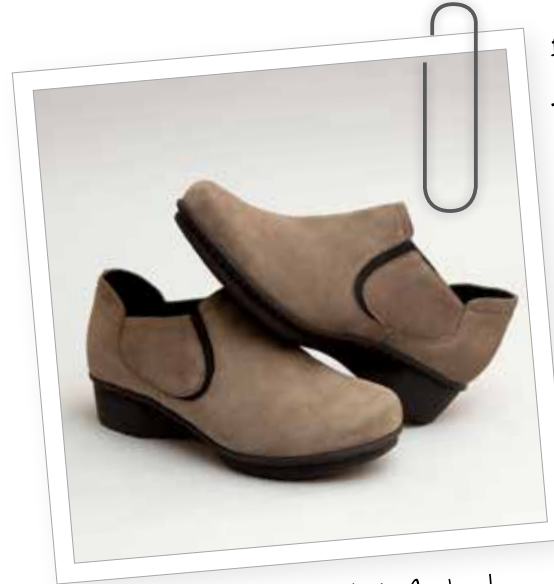
Lynn, Khaki Nubuck

From bold primary colors to subtle neutrals, Lynn offers refined style in a timeless slip-on.