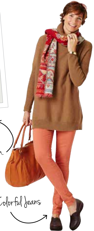
Perfect Pairing: Colorful Jeans