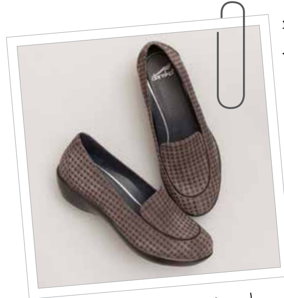
Debra, Grey Houndstooth

The versatile Debra loafer provides a reliable companion for your fun-filled agendas: shopping trips, lunch dates and evenings with friends.