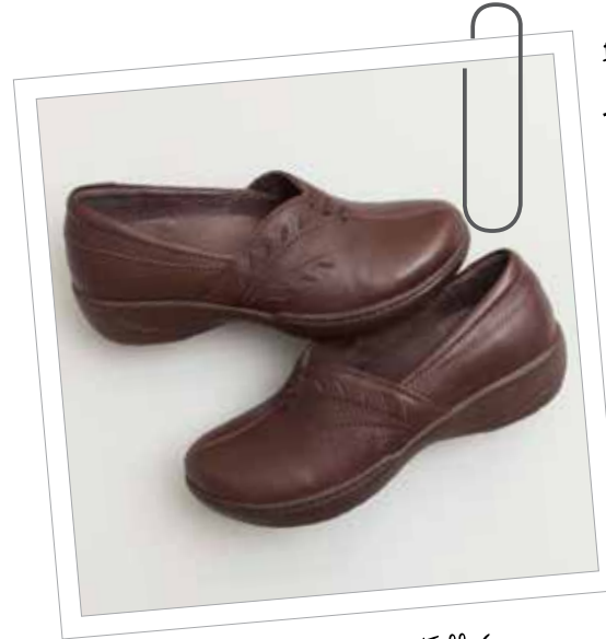
Abigail, Brown Milled Full Grain Step into this versatile style and prepare for comfortable travels to every destination.