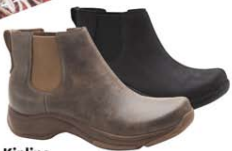
Kipling women's 36-42 (US 6-12) Stone Distressed Charcoal Waterproof Nubuck