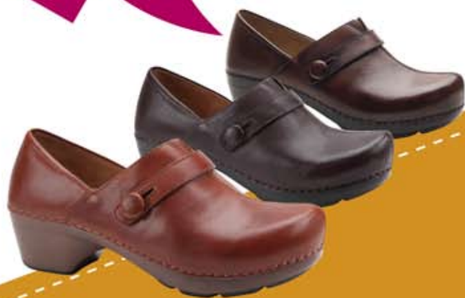
Solstice women's 35-43 (US 5-13) Saddle Full Grain Chocolate Full Grain Brown Brush-off