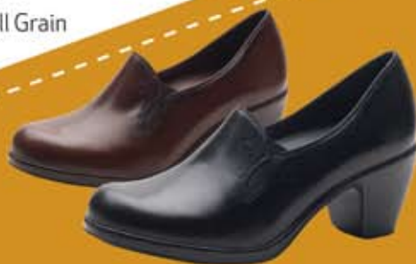
Beth women's 35-43 (US 5-13) Chocolate Milled Nappa Black Milled Nappa