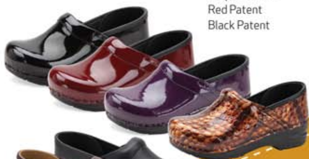
Gitte kids' 26-34 (US 8.5-4) Black Patent Red Patent Purple Patent Tiger's Eye Patent Indigo Full Grain Mocha Full Grain Black Full Grain Bubblegum Patent