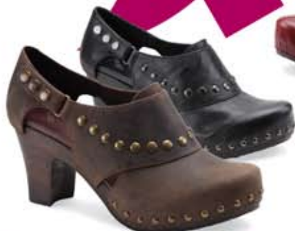
Ryder women's 36-42 (US 6-12) Brown Crazy Horse Black Scrunched Full Grain