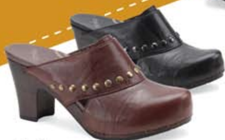
Rudy women's 36-42 (US 6-12) Brown Scrunched Full Grain Black Scrunched Full Grain