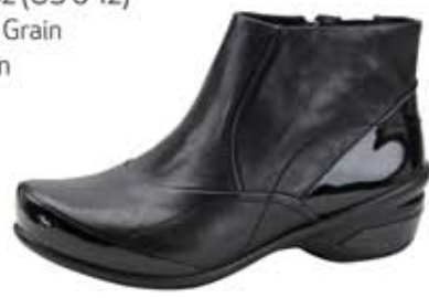
Andorra women's 36-42 (US 6-12) Black Nappa