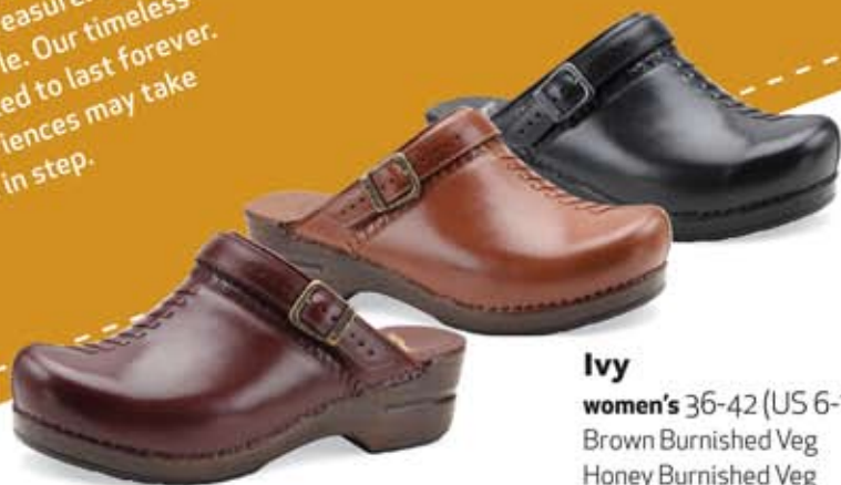
Ivy women's 36-42 (US 6-12) Brown Burnished Veg Honey Burnished Veg Black Burnished Veg

Sometimes all you need is imagination to turn a well-made object into a new treasure. That's because quality is always in style. Our timeless designs are carefully constructed to last forever. So no matter where your experiences may take you, your Danskø shoes will be in step.