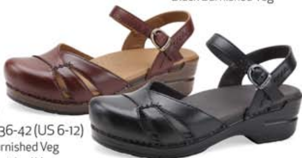
Maeve women's 36-42 (US 6-12) Brown Burnished Veg Black Burnished Veg