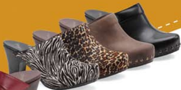
Rae women's 35-42 (US 5-12) Red Full Grain Zebra Pony Leopard Pony Brown Crazy Horse Black Full Grain

* EASY RIDER A true master can make even the most difficult task look easy. Need proof? Check out our beautifully constructed Rio collection. Three inch heels yet feature all the comfort of our original clog! Go ahead, enjoy the ride.