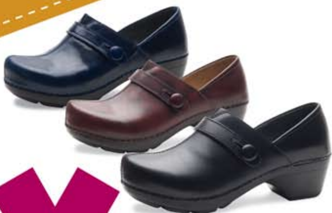
Solstice women's 35-43 (US 5-13) Blue Burnished Veg Cordovan Brush-Off Black Full Grain