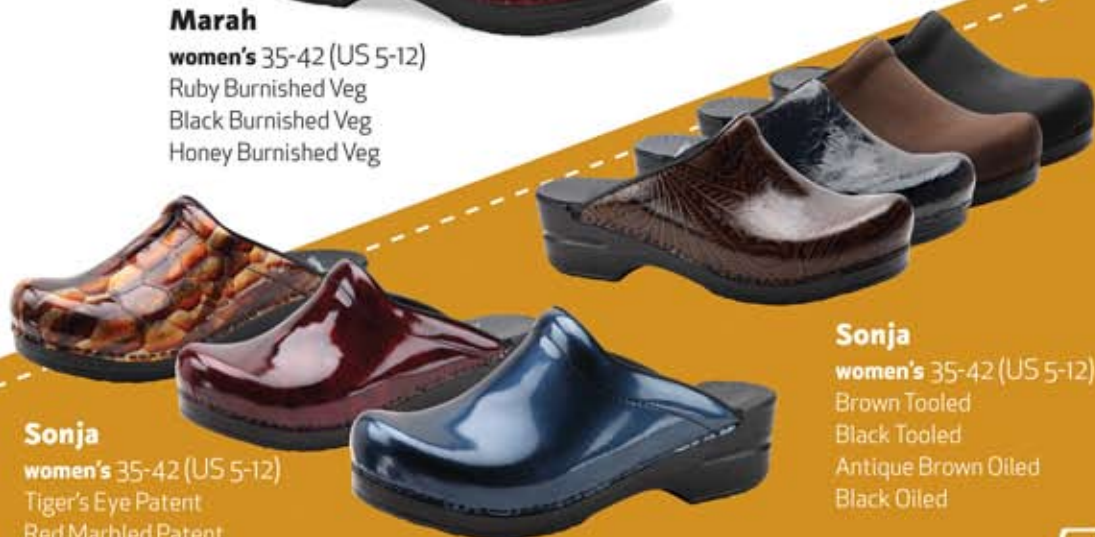
Sonja women's 35-42 (US 5-12) Tiger's Eye Patent Red Marbled Patent Blue Pearlized Patent