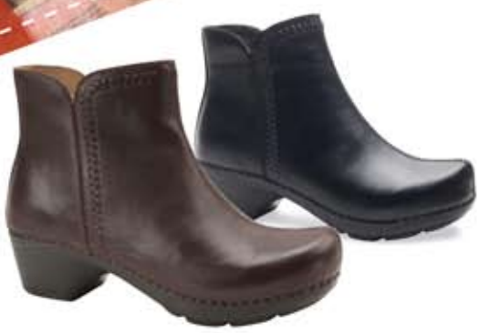
Scout women's 36-42 (US 6-12) Chocolate Full Grain Black Full Grain