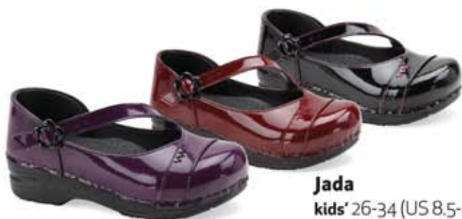
Jada kids' 26-34 (US 8.5-4) Purple Patent Red Patent Black Patent