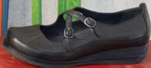
Shown: Pia Chocolate Glazed Full Grain Pam Pomegranate Glazed Full Grain Portia Black Glazed Full Grain