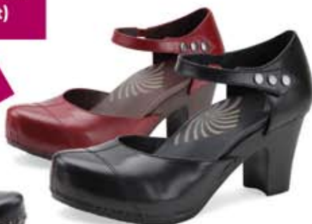
Rachel women's 35-42 (US 5-12) Red Full Grain Black Full Grain