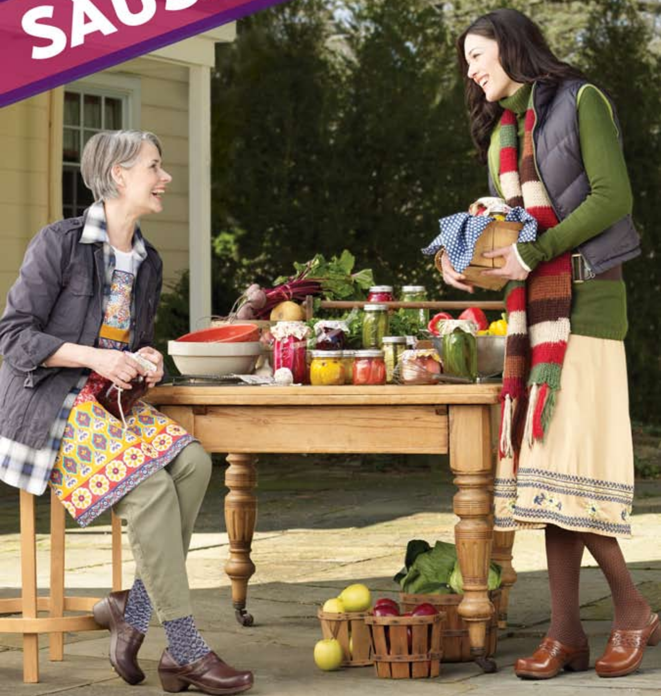
Shown Above: Summer Chocolate Full Grain shown with Flourish sock (page 19) Shyanne Saddle Full Grain