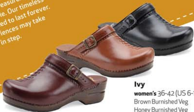
Ivy women's 36-42 (US 6-12) Brown Burnished Veg Honey Burnished Veg Black Burnished Veg

Sometimes all you need is imagination to turn a well-made object into a new treasure. That's because quality is always in style. Our timeless designs are carefully constructed to last forever. So no matter where your experiences may take you, your Danskø shoes will be in step.