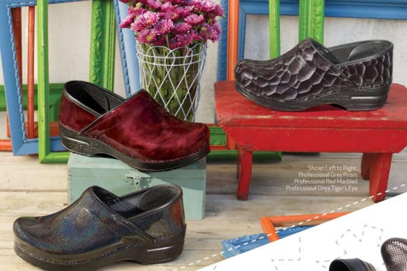
Shown Left to Right: Professional Grey Prism Professional Red Marbled Professional Onyx Tiger's Eye