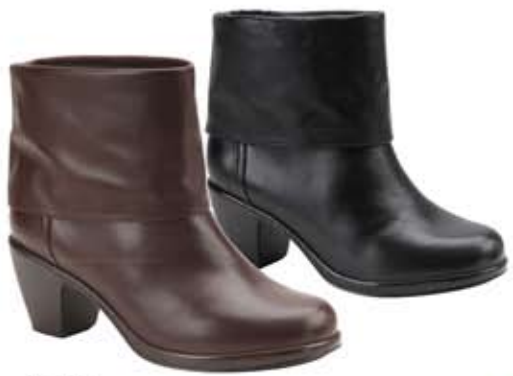
Bobbi women's 36-43 (US 6-13) Chocolate Milled Nappa Black Milled Nappa