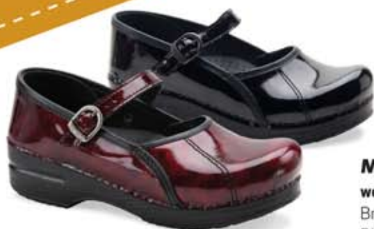
Marcelle women's 35-42 (US 5-12) Ruby Burnished Veg Black Burnished Veg Honey Burnished Veg