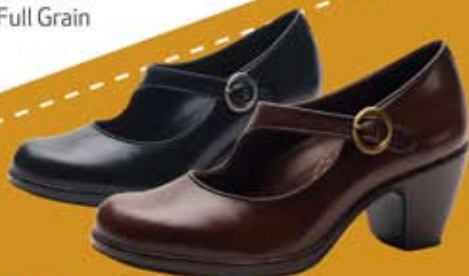
Becca women's 35-43 (US 5-13) Black Nappa Brown Nappa