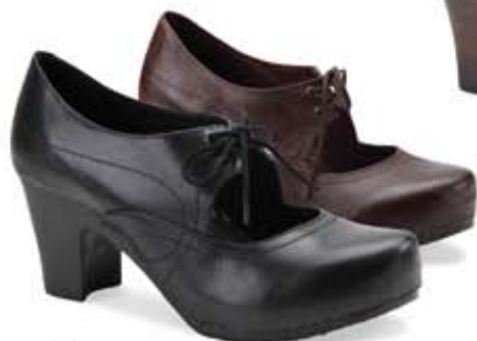
Rory women's 36-42 (US 6-12) Black Scrunched Full Grain Brown Scrunched Full Grain