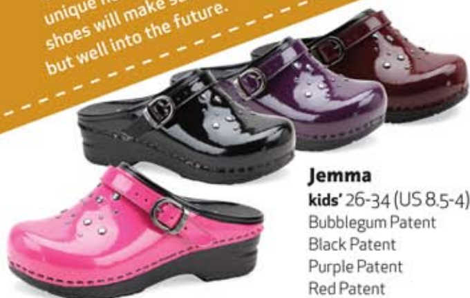
Jemma kids' 26-34 (US 8.5-4) Bubblegum Patent Black Patent Purple Patent Red Patent

* WELL ROUNDED From collecting bugs to gymnastics you make sure she has a chance to explore it all. Now see that she does it in Dansko style. Designed to fit the unique needs of your child's growing foot these shoes will make sure she's not only active today but well into the future.