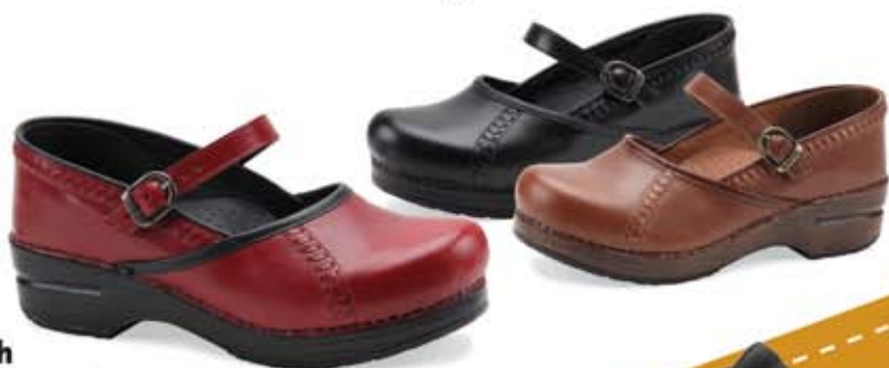
Marah women's 35-42 (US 5-12) Ruby Burnished Veg Black Burnished Veg Honey Burnished Veg