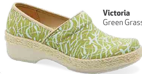
Victoria Green Grass