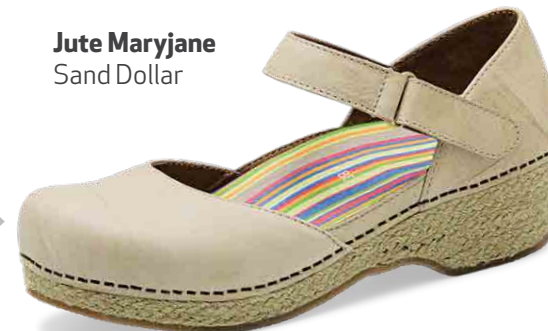
Jute Maryjane Sand Dollar