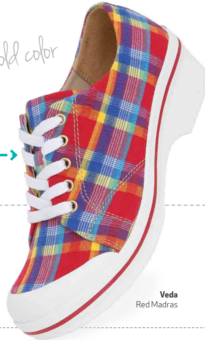
Veda Red Madras