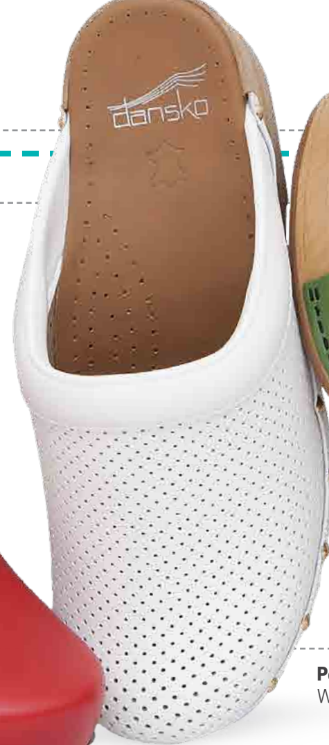
Perfed Sonja White