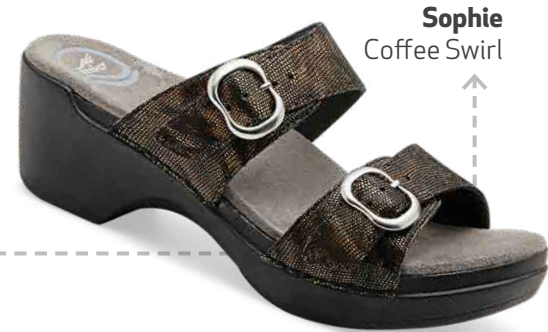
Sophie Coffee Swirl