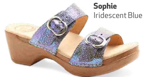
Sophie Iridescent Blue