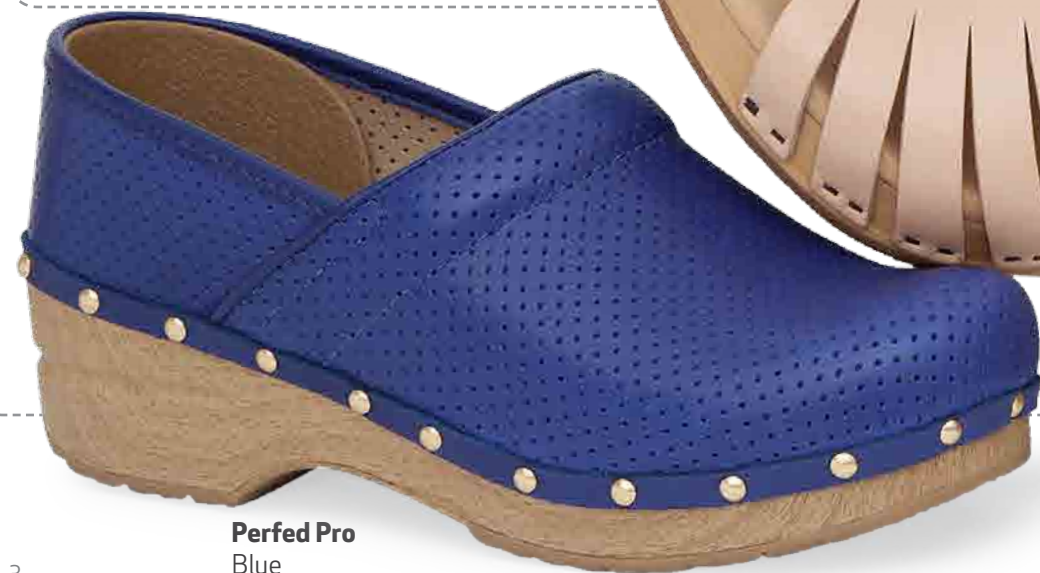
Perfed Pro Blue