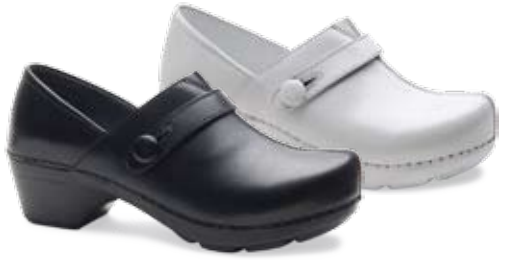
Solstice women's 35-43 (US 5-13) Black Brush-off White Leather