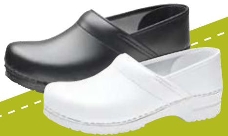
Women's and Men's Professional women's 35-42 (US 5-12) men's 42-47 (US 8.5-14) Black Box* White Box *Also available in size 48 (US 15)