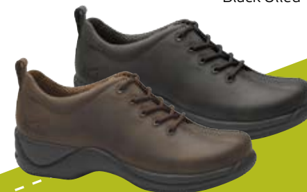
Carson men's 41-47 (US 7.5-14) Brown Oiled Black Oiled