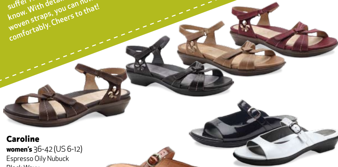
Caroline women's 36-42 (US 6-12) Espresso Oily Nubuck Black Waxy Stone Oily Nubuck Sangria Oily Nubuck

* COMFORT WITH A TWIST Just because you reject the idea that you have to suffer for fashion, doesn't mean anyone needs to know. With details like riveted flowers and hand woven straps, you can now mingle confidently and comfortably. Cheers to that!