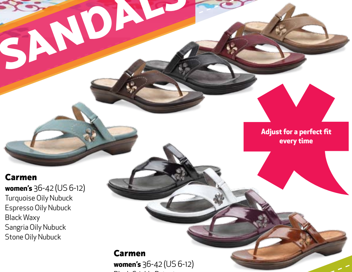
Carmen women's 36-42 (US 6-12) Turquoise Oily Nubuck Espresso Oily Nubuck Black Waxy Sangria Oily Nubuck Stone Oily Nubuck