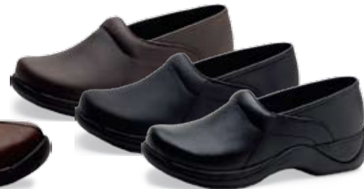
Cooper men's 41-47 (US 7.5-14) Brown Oiled Black Oiled Black Leather