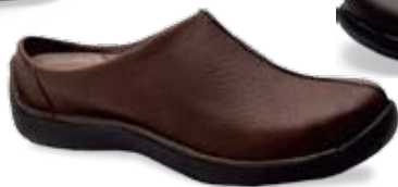
Sol men's 41-47 (US 7.5-14) Chocolate Soft Full Grain