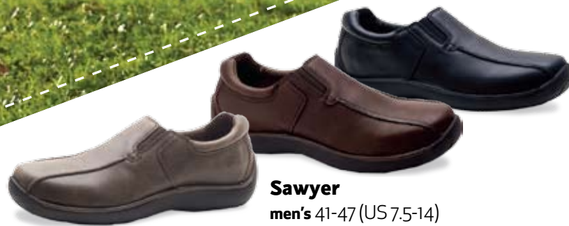
Sawyer men's 41-47 (US 7.5-14) Stone Distressed Chocolate Soft Full Grain Black Soft Full Grain