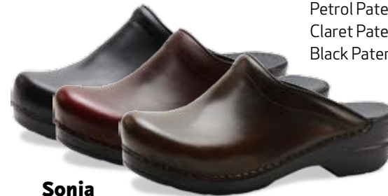
Sonja women's 35-42 (US 5-12) Black Cabrio Cordovan Cabrio Hickory Cabrio