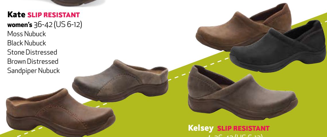
Kelsey SLIP RESISTANT women's 36-42 (US 6-12) Stone Distressed Brown Distressed Black Nubuck