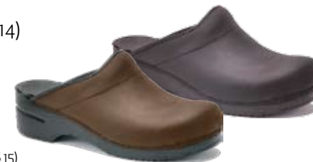
Karl men's 42-47 (US 8.5-14) Brown Oiled Black Oiled