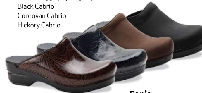
Sonja women's 35-42 (US 5-12) Brown Tooled Black Tooled Antique Brown Oiled Black Oiled