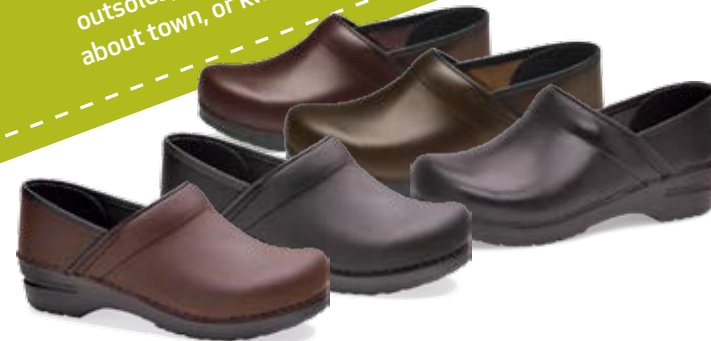
Professional men's 42-47 (US 8.5-14) Antique Brown Oiled* Black Oiled* Black Cabrio* Hickory Cabrio* Cordovan Cabrio *Also available in size 48 (US 15)