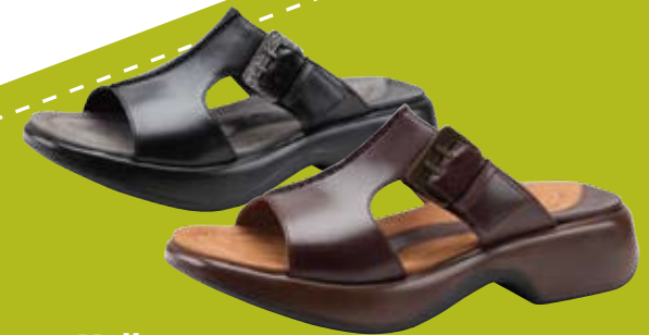
Mallory women's 36-42 (US 6-12) Black Veg-Tan Brown Veg-Tan

Shown Above: Colette Toffee Crinkle Patent, Carmen Sangria Oily Nubuck, Caroline Black Waxy