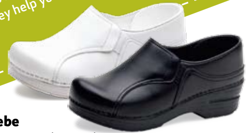
Phoebe women's 35-43 (US 5-13) White Box Black Box

To view our complete Occupational collection visit dansko.com