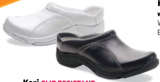
Kari SLIP RESISTANT women's 36-42 (US 6-12) White Leather Black Pull-Up

Shown Above: Solstice Blue Burnished Veg, Professional Black Patent