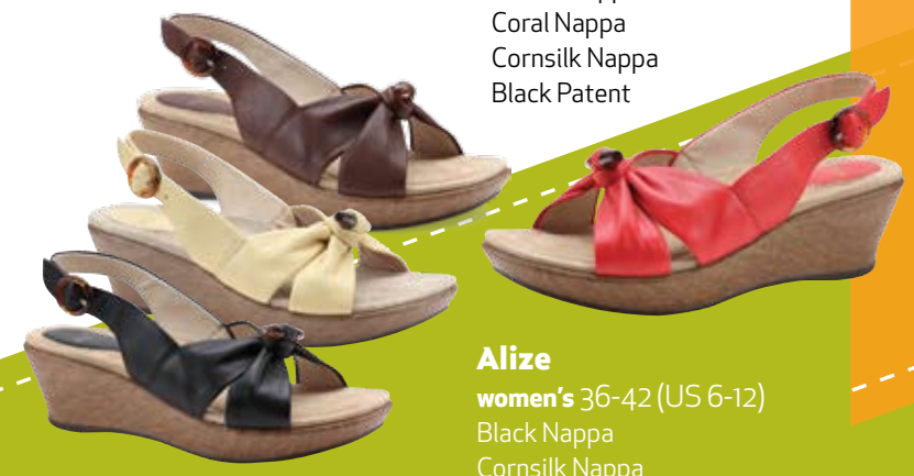
Alize women's 36-42 (US 6-12) Black Nappa Cornsilk Nappa Brown Nappa Coral Nappa