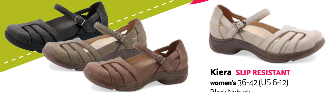
Kiera SLIP RESISTANT women's 36-42 (US 6-12) Black Nubuck Moss Nubuck Latte Nubuck Sandpiper Nubuck

Removable molded insole for superior comfort