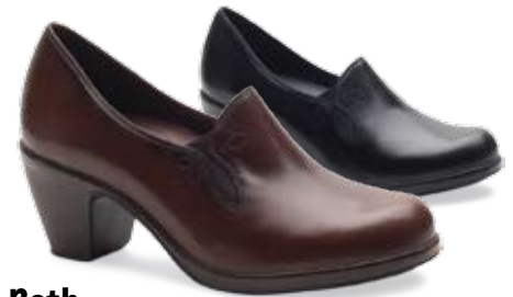
Beth women's 36-43 (US 6-13) Brown Nappa Black Nappa