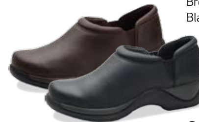
Cutter men's 41-47 (US 7.5-14) Brown Oiled Black Oiled