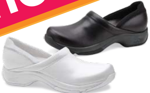
Kelsey SLIP RESISTANT women's 36-42 (US 6-12) White Leather Black Pull-Up