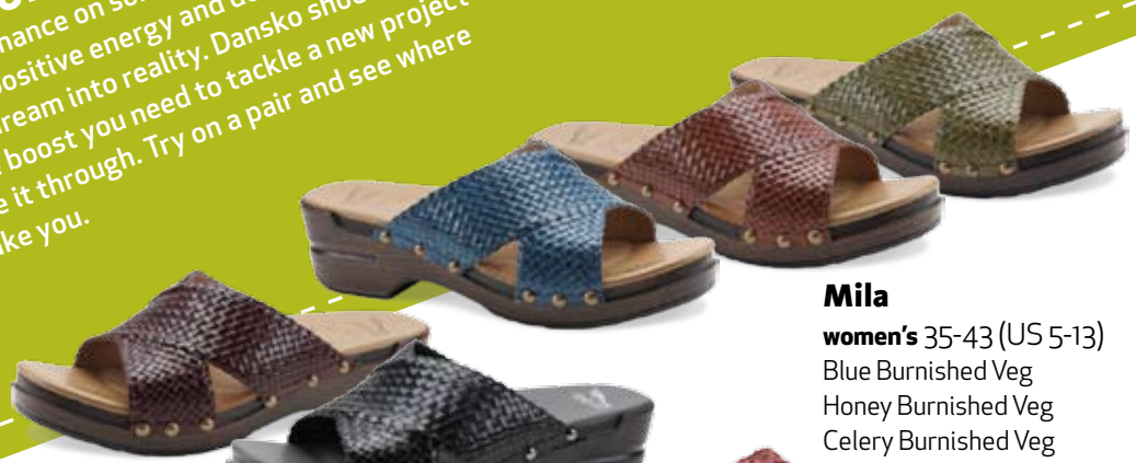
Mila women's 35-43 (US 5-13) Blue Burnished Veg Honey Burnished Veg Celery Burnished Veg

* VENTURE OPTIMISM Take a chance on something new. All it takes is a little positive energy and determination to turn a dream into reality. Dansko shoes give you the boost you need to tackle a new project and see it through. Try on a pair and see where they take you.