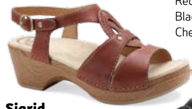
Sigrid women's 35-43 (US 5-13) Brandy Waxy Black Waxy