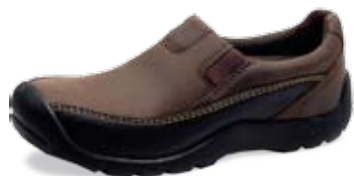
Teague men's 41-47 (US 7.5-14) Brown Oiled