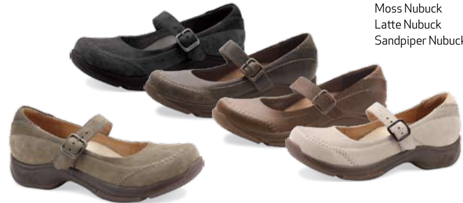
Kate SLIP RESISTANT women's 36-42 (US 6-12) Moss Nubuck Black Nubuck Stone Distressed Brown Distressed Sandpiper Nubuck