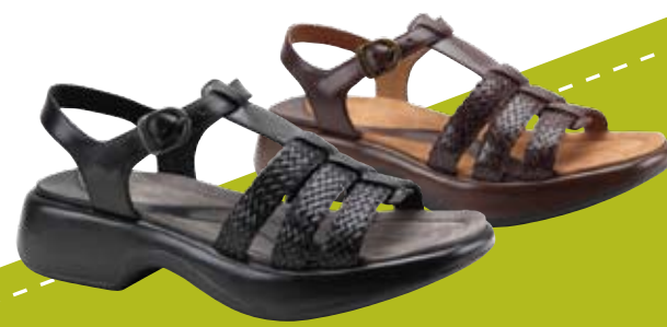
Marley women's 36-42 (US 6-12) Black Veg-Tan Brown Veg-Tan