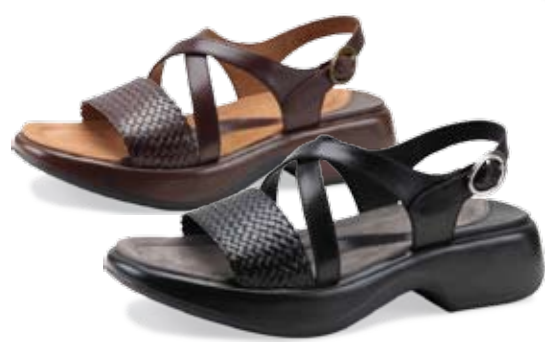
Meg women's 36-42 (US 6-12) Brown Veg-Tan Black Veg-Tan