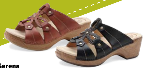
Serena women's 35-43 (US 5-13) Brandy Waxy Black Waxy