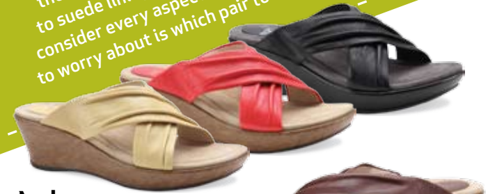
Avalon women's 36-42 (US 6-12) Cornsilk Nappa Coral Nappa Black Nappa Brown Nappa