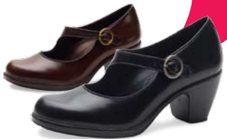
Becca women's 36-43 (US 6-13) Brown Nappa Black Nappa

Dansko's Belmont and Louvre collections carry the APMA Seal of Acceptance.