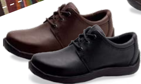
Sloane men's 41-47 (US 7.5-14) Chocolate Soft Full Grain Black Soft Full Grain