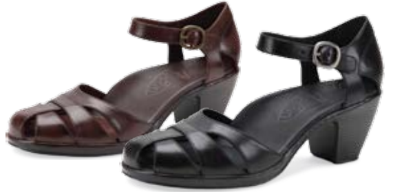
Bliss women's 36-43 (US 6-13) Brown Nappa Black Nappa