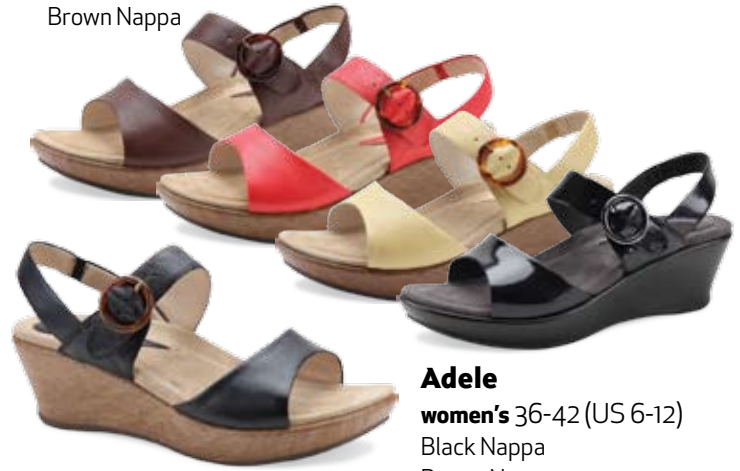
Adele women's 36-42 (US 6-12) Black Nappa Brown Nappa Coral Nappa Cornsilk Nappa Black Patent