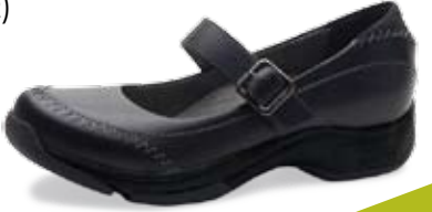
Kate SLIP RESISTANT women's 36-42 (US 6-12) Black Pull-Up