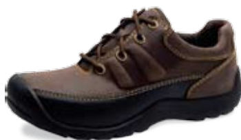
Tyler men's 41-47 (US 7.5-14) Brown Oiled