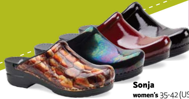
Sonja women's 35-42 (US 5-12) Tiger's Eye Patent Petrol Patent Claret Patent Black Patent