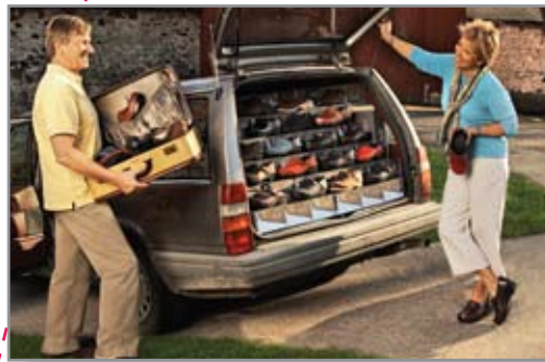
Original "social networking" ↗

P.S. Check out our latest styles for spring. If you haven't become a "fan" yet, I am sure you will after you see our great new sandal collections!