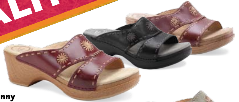
Sunny women's 35-43 (US 5-13) Red Burnished Veg Black Nappa Chestnut Burnished Veg