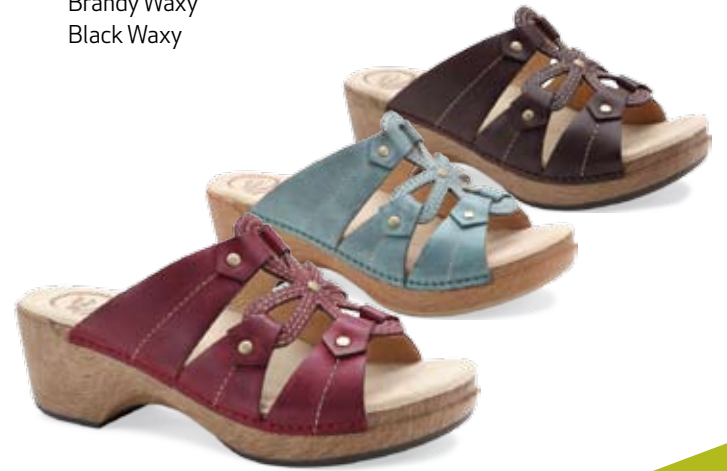
Serena women's 35-43 (US 5-13) Sangria Waxy Turquoise Waxy Java Waxy