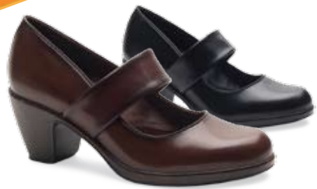
Brooke women's 36-43 (US 6-13) Brown Nappa Black Nappa