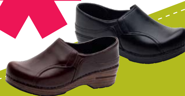
Phoebe women's 35-43 (US 5-13) Brown Pull-up Black Pull-up

Dear Dansko, Lately I have been waking up with killer heel pain. It's been so bad I've switched my heels for flats but to no avail. Hoping you have a comfort prescription for me.