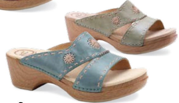
Sunny women's 35-43 (US 5-13) Turquoise Burnished Veg Celery Burnished Veg