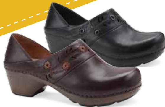
Summer women's 35-43 (US 5-13) Chocolate Full Grain Black Full Grain