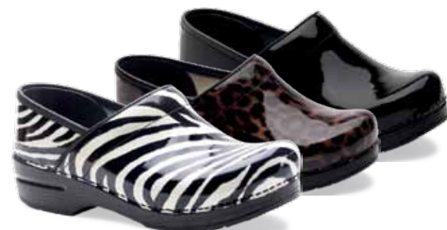
Professional Patent women's 36-42 (US 6-12) Zebra Patent Leopard Patent* Black Patent* *Also available in size 35 & 43 (US 5 & 13). Black Patent available in Narrow & Wide Pro