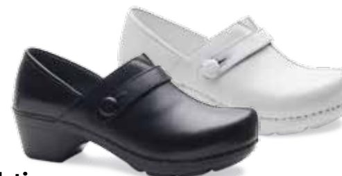
Solstice women's 35-43 (US 5-13) Black Brush-off White Leather