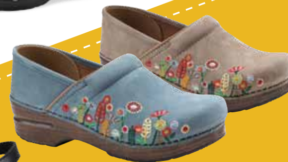
Professional Embroidered women's 36-42 (US 6-12) Blue Earthybuck Oatmeal Earthybuck