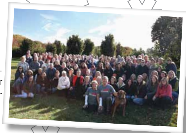
The Dansko team

Throughout this book you'll find a dozen more places we seek inspiration—from nature to our families to gorgeous shoes. Hopefully one of them will inspire you or at least make you happy. Enjoy.