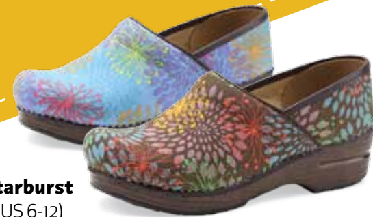
Vegan Pro Starburst women's 36-42 (US 6-12) Blue Multi Canvas Brown Multi Canvas

* ROCK DON'T ROLL Whether you're hard at work or working hard at play, you'll hit the jackpot in Dansko shoes. They're designed with a unique rocker bottom for energy return, great stability and all day comfort. See how much fun rock without the roll can be.