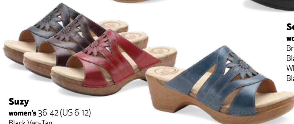
Suzy women's 36-42 (US 6-12) Black Veg-Tan Chocolate Veg-Tan Crimson Veg-Tan Denim Veg-Tan