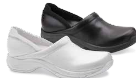
Kelsey SLIP RESISTANT women's 35-43 (US 5-13) White Leather Black Pull-Up