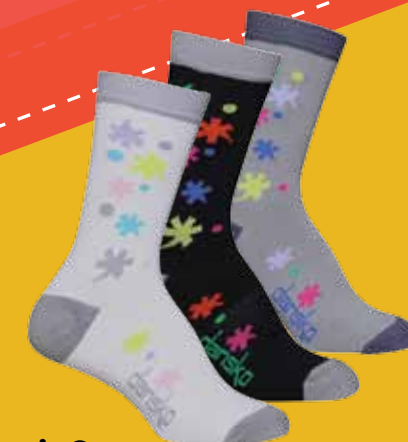
Cosmic Crew women's Merino Wool Grey Black White