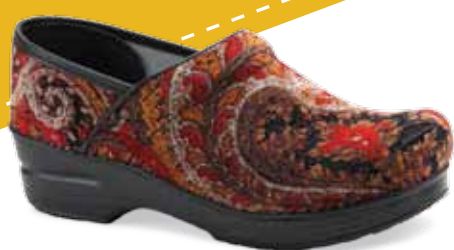
Vegan Pro women's 36-42 (US 6-12) Black Striped Multi Striped Brown Tapestry Blue Tapestry Rust Tapestry Red Tapestry