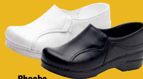
Phoebe women's 35-43 (US 5-13) White Box Black Box Also available in Brown & Black Pull-up

To view our complete Occupational collection visit dansko.com