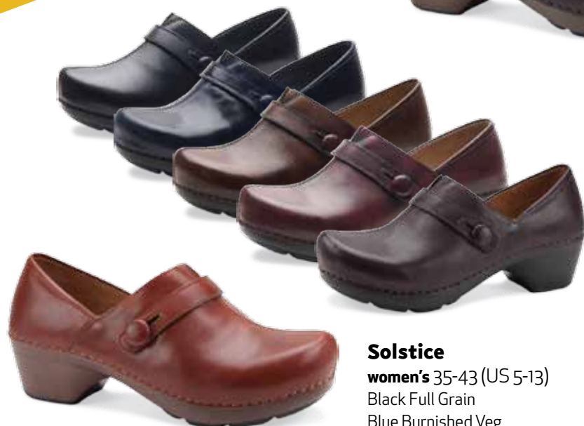
Solstice women's 35-43 (US 5-13) Saddle Full Grain