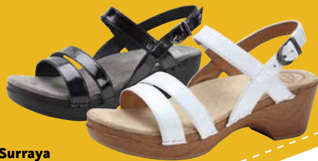
Surraya women's 35-43 (US 5-13) Black Crinkle Patent White Crinkle Patent

Lightweight outsoles and pillow soft insoles