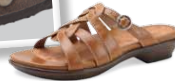
Distressed Leathers & Nail heads