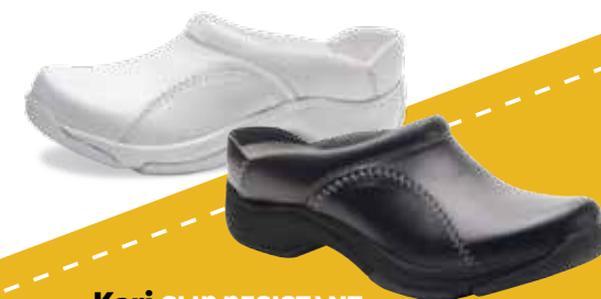
Kari SLIP RESISTANT women's 36-42 (US 6-12) White Leather Black Pull-Up