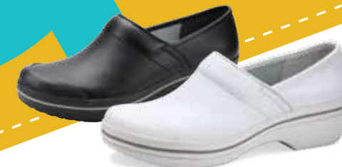
Volley Box SLIP RESISTANT women's 36-42 (US 6-12) White Box Black Box

To view our complete Occupational collection visit dansko.com