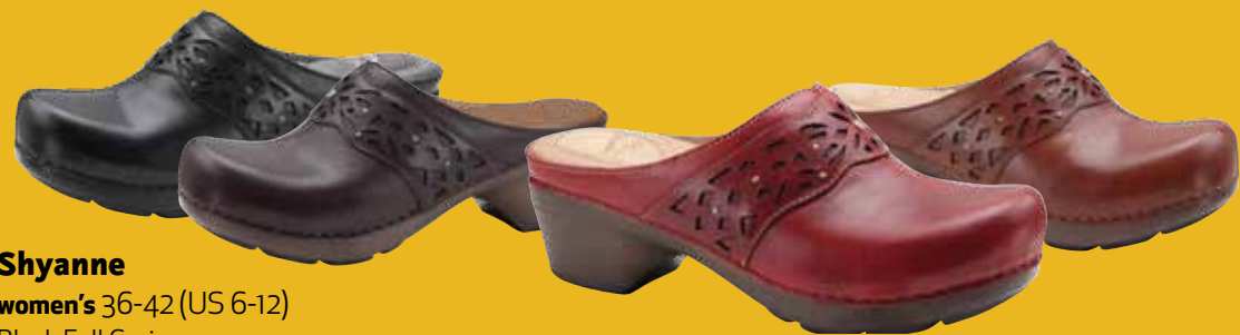
Shyanne women's 36-42 (US 6-12) Black Full Grain Chocolate Full Grain Crimson Veg-Tan Saddle Full Grain