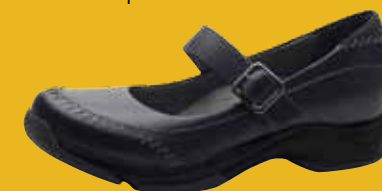
Kate SLIP RESISTANT women's 36-43 (US 6-13) Black Pull-Up