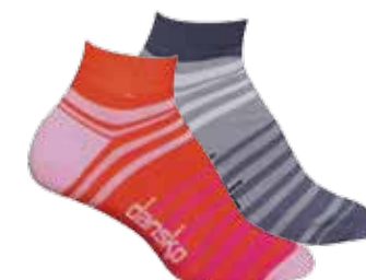
Awning Stripe Ankle women's COOLMAX® EcoMade Pink Grey (Also available in Blue and Purple)