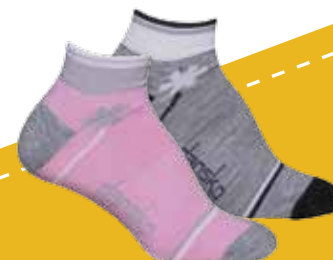
Galaxy Ankle women's Merino Wool Grey Orchid (Also available in crew length)