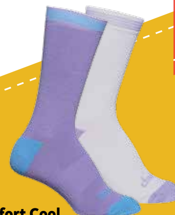
Comfort Cool women's COOLMAX® EcoMade Lavender Grey (Also available in black and grey)