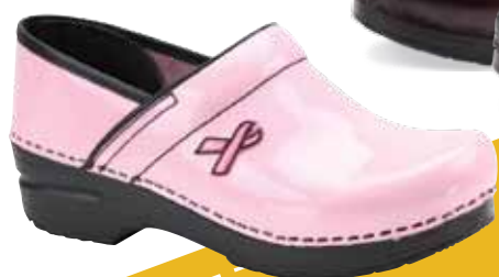
Professional Pink Ribbon women's 35-43 (US 5-13) Pink Patent