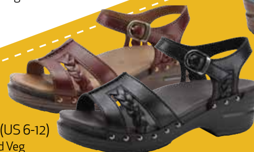
Micki women's 36-42 (US 6-12) Brown Burnished Veg Black Burnished Veg