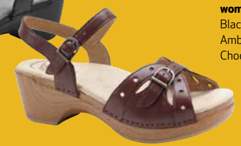
Sakura women's 36-42 (US 6-12) Black Veg-Tan Amber Veg-Tan Chocolate Veg-Tan