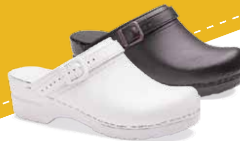
Ingrid women's 35-42 (US 5-12) White Box Black Box Also available in Brown & Black Oiled