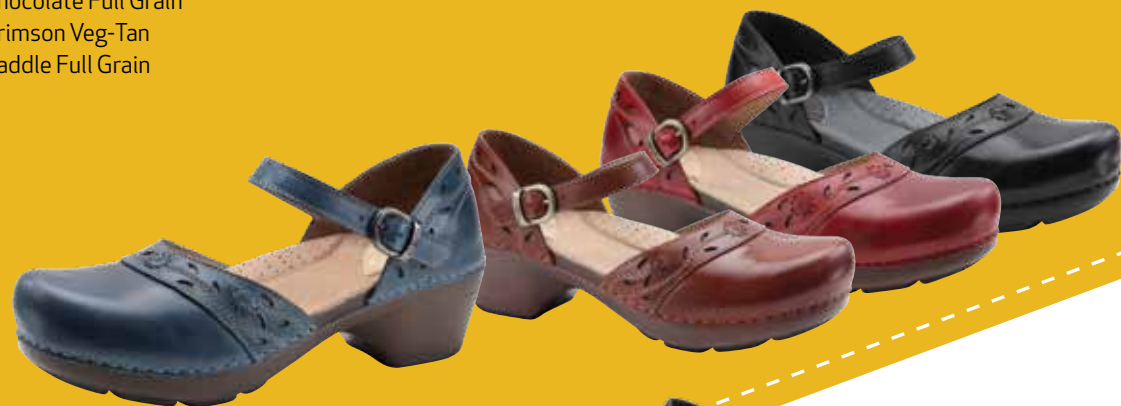
Stefanie women's 36-42 (US 6-12) Denim Veg-Tan Saddle Full Grain Crimson Veg-Tan Black Full Grain