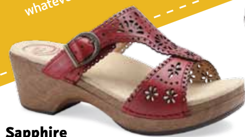
Sapphire women's 35-43 (US 5-13) Crimson Veg-Tan Black Veg-Tan Denim Veg-Tan Chocolate Veg-Tan Amber Veg-Tan