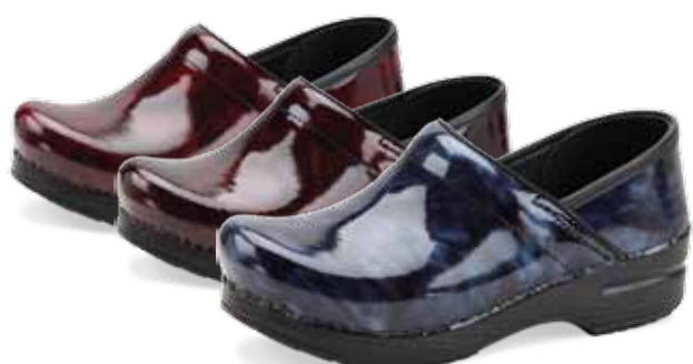
Professional Marbled Patent women's 35-42 (US 5-12) Red Marbled Patent Brown Marbled Patent Blue Marbled Patent