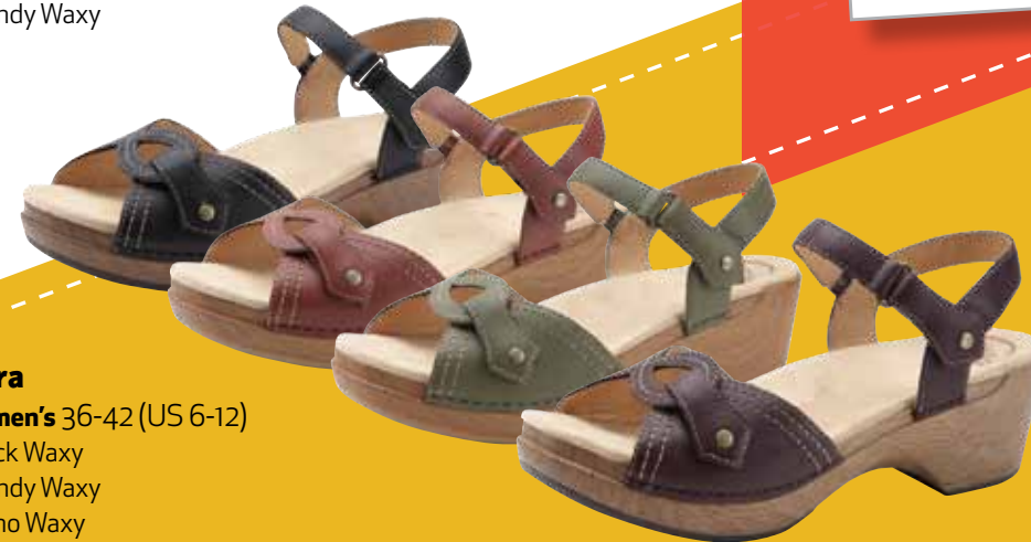
Sara women's 36-42 (US 6-12) Black Waxy Brandy Waxy Chino Waxy Java Waxy