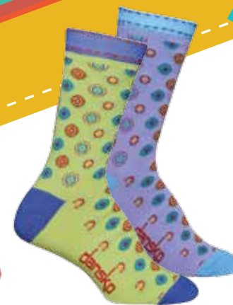
Orbit Crew women's COOLMAX® EcoMade Jalapeno Lavender (Also available in Black and White)