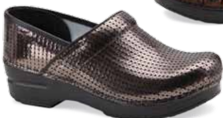
Professional Sequins women's 35-43 (US 5-13) White Gold Sequins