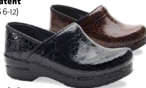
Professional Tooled women's 35-43 (US 5-13) Black Tooled Brown Tooled