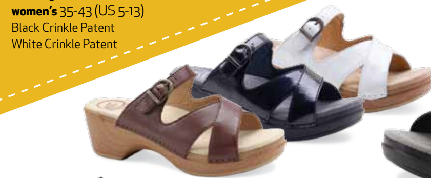
Sela women's 35-43 (US 5-13) Brown Pull-up Black Crinkle Patent White Crinkle Patent Black Pull-up