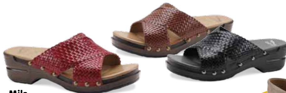
Mila women's 35-43 (US 5-13) Ruby Burnished Veg Honey Burnished Veg Black Burnished Veg