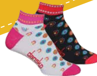
Orbit Ankle women's COOLMAX® EcoMade Black White