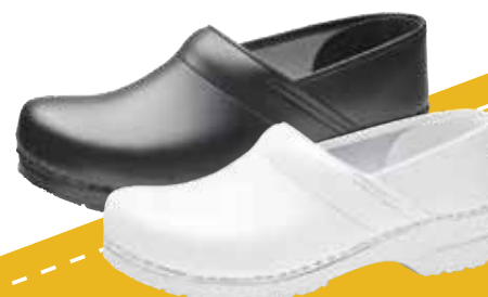
Women's and Men's Professional women's 35-42 (US 5-12) men's 42-47 (US 8.5-14) Black Box* White Box *Also available in size 48 (US 15) White box also available in Narrow and Wide Pro 36-42 (US 6-12) Black box also available in Wide Pro 36-42 (US 6-12)