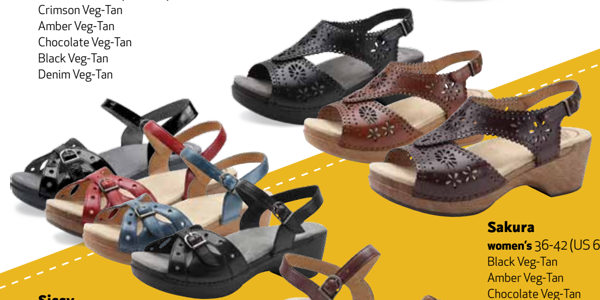
Sissy women's 35-43 (US 5-13) Black Patent Crimson Veg-Tan Denim Veg-Tan Black Pull-up Brown Pull-up