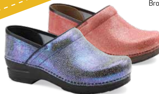
Professional Shagreen women's 36-42 (US 6-12) Iridescent Blue Shagreen Terracotta Shagreen