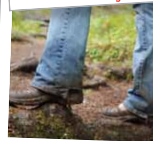
My Arcadia clogs are perfect for exploring