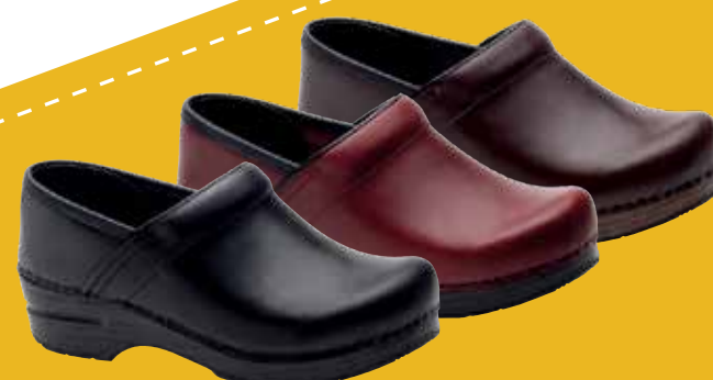
Professional Pull-up women's 35-43 (US 5-13) Black Pull-up Crimson Pull-up Brown Pull-up* Indigo Pull-up *Also available in Wide Pro