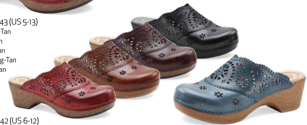
Skylar women's 36-42 (US 6-12) Crimson Veg-Tan Amber Veg-Tan Chocolate Veg-Tan Black Veg-Tan Denim Veg-Tan