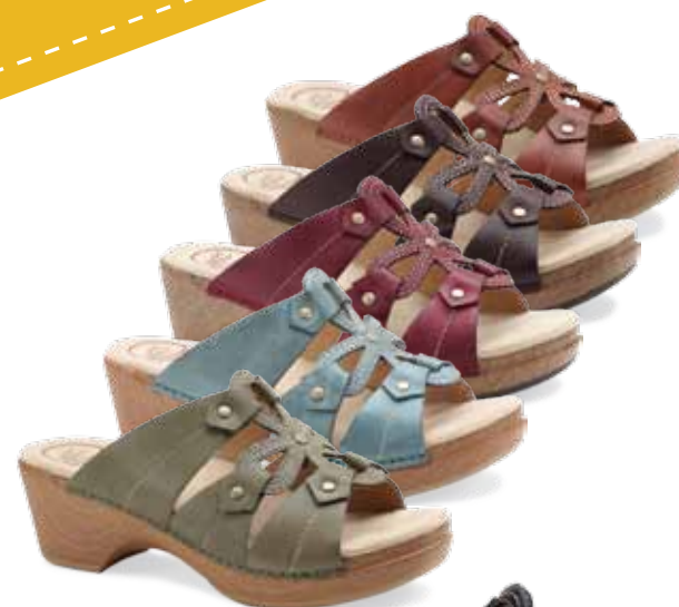
Serena women's 35-43 (US 5-13) Chino Waxy Turquoise Waxy Sangria Waxy Java Waxy Brandy Waxy Black Waxy