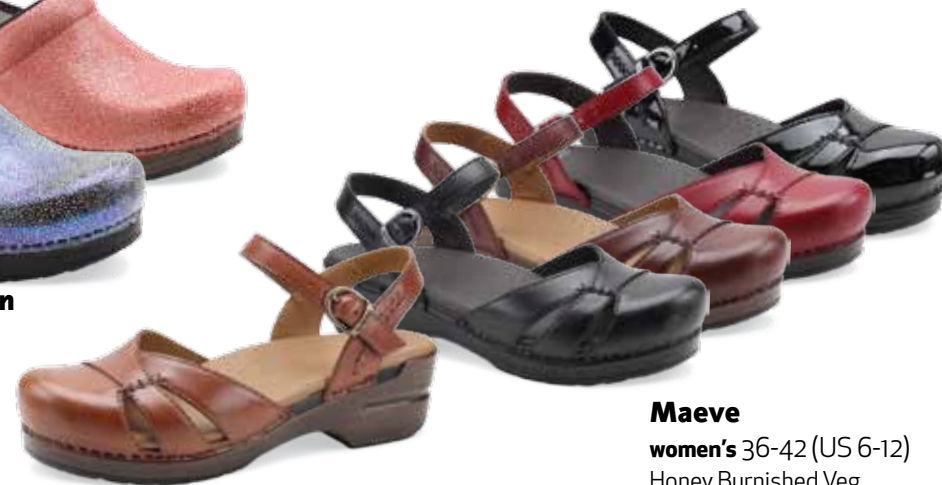
Maeve women's 36-42 (US 6-12) Honey Burnished Veg Black Burnished Veg Brown Burnished Veg Ruby Burnished Veg Black Patent