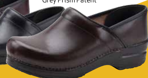
Professional Prism women's 36-42 (US 6-12) Grey Prism Patent