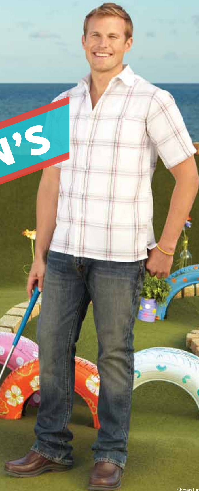
Shown Left: Wayne Mocha Full Grain

* JOIN THE CLUB Do you play for fun or keeps? Either way, there's a pair of Dansko shoes for you. No membership required, just a love of great style and quality. Slip on a pair today and see how Dansko comfort keeps you in the swing of things.