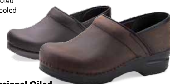
Professional Oiled women's 35-43 (US 5-13) Black Oiled Brown Oiled Also available in Narrow Pro 36-43 (US 6-13)